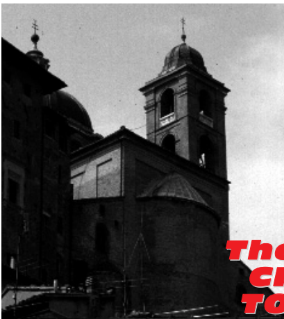
The New CHORI TOWER