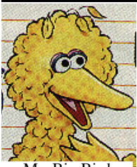
Mr. Big Bird