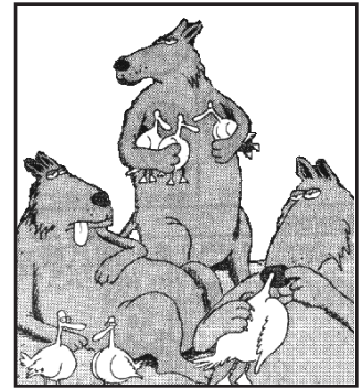
Quackers at the Oakland Estuary